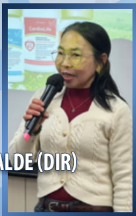
SALVE GERALDE (DIR)